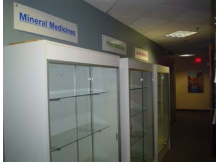
Display cases for museum holdings