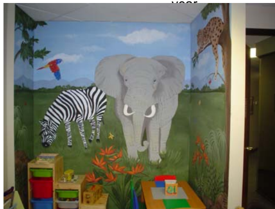
New Mural in Kid's Waiting Area

The AMCH Website is a popular visitor's site for inquiries about homeopathic medicine. We receive nearly 200 daily visitors with over 200,000 page views per