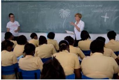
Acute Care Program-Haiti